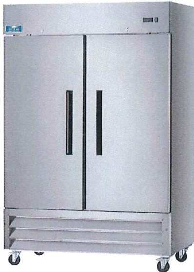
Artic Air Avantco 54" Refrigerator

Thank you for your partnership in changing lives for good!