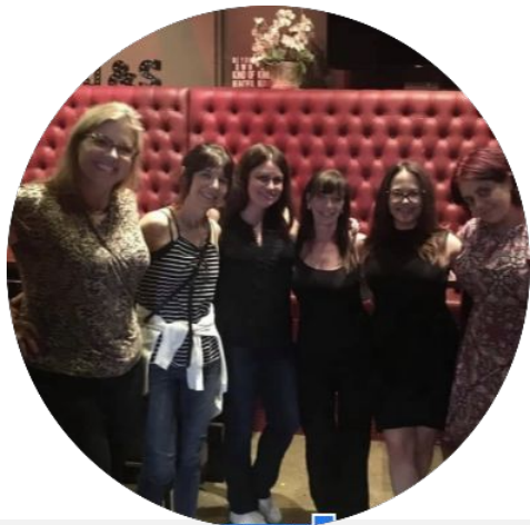
First Meeting (2019)

Marriage didn't unfold as I'd hoped, but my two sons gave me strength and a new purpose. Starting over was daunting, as I had no money, no credit and no assets, but with courage, we embarked on a fresh start with only one suitcase for each of us. Securing a stable home and income proved challenging as I needed assistance with childcare and was unable to take a full-time role. I was considered overqualified for part-time jobs and when I finally was hired for a few hours a week, my food stamp benefits went down to almost nothing. That's when I realized that there is a gap over poverty and the system perpetuates people to stay on it as I would have made more money staying home but wouldn't get anywhere with my career. I took the leap of faith and started to share my story with other parents who gave me a hand up instead of a hand out by offering odd jobs, but I still wasn't covering my expenses. Six months later, a promotion brought a glimmer of hope. Yet, it was the shared experiences of other single moms that truly ignited my passion. Their stories revealed systemic barriers, inspiring me to create SHE IS HOPE LA, a beacon of support for single moms like us.